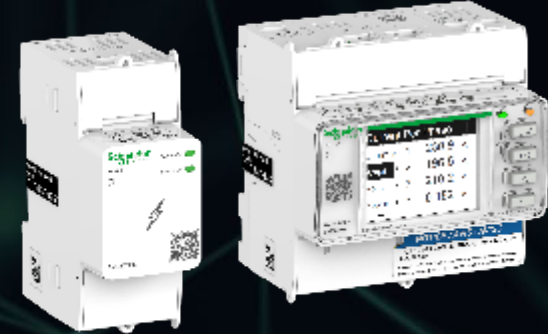
Manufacturing Location : SEIPL, Bangalore, INDIA

Applications : Capable of essential cost management